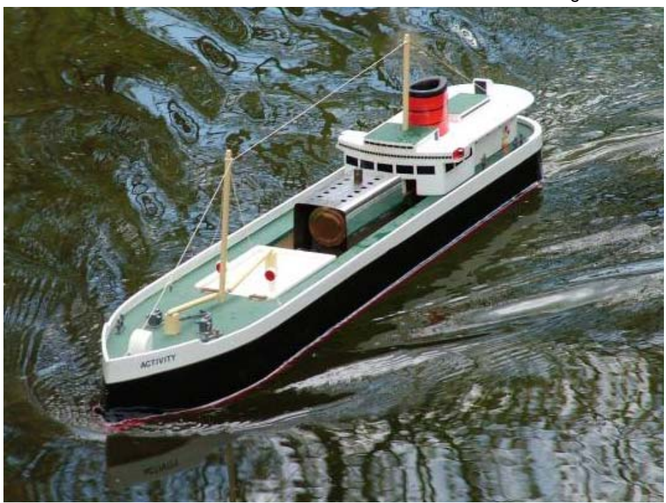
Our next very own pond sailing evening will be Friday 6^{\text{th}} July from 6.30 pm until we can't see each other.

See you next time, and the pond is clear!!!! (See I had to mention it).